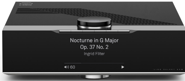
Selekt DSM System Hub

Choose System Hub only if you either have Linn Exakt integrated speakers, or Linn Exaktbox(es)